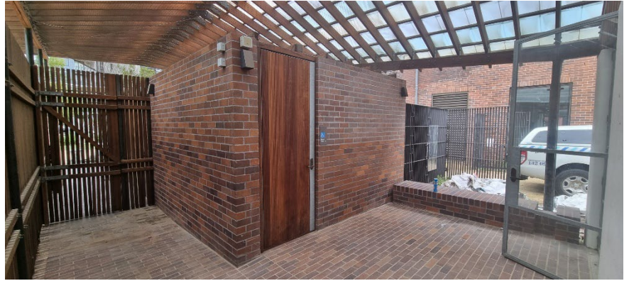
amenities at the rear