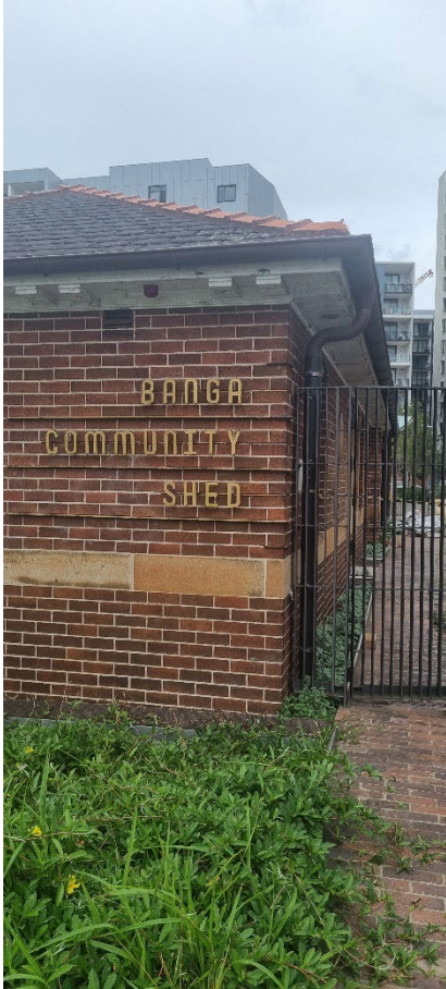
entry and signage